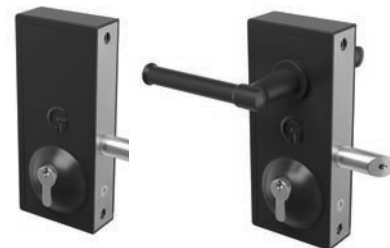
See website for full details