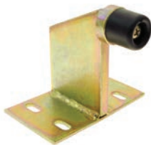
Floor-Mounted Gate Stop ACCS-MSH-1830