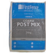
Post Mix POST-MIX-0001

For a strong installation, you will need post mix or ground anchor bolts, depending on the post style; a dig in or bolt down format.