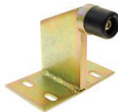
Floor-Mounted Gate Stop ACCS-MSH-1830