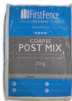
Post Mix POST-MIX-0001

For a strong installation, you will need post mix or ground anchor bolts, depending on the post style; a dig in or bolt down format.