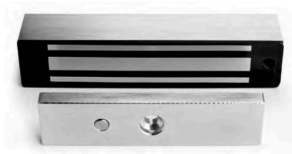
Gate Lock - AEM/MINIGATE