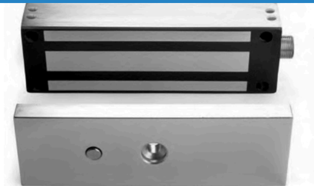
Gate Lock - AEM/GATE/F/S