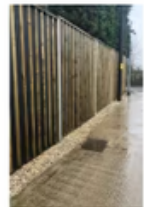
EchoAbsorb Acoustic Fencing (31)