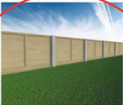
EchoGroove Lite Timber Acoustic Fencing (4)