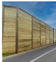
EchoGroove Acoustic Fencing (35)