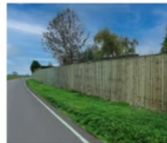
EchoReflect Acoustic Fencing (31)