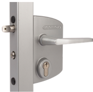
LAKQ - bolt on for square profiles

High-security mechanical and digital locks and keeps for a wide range of gate types