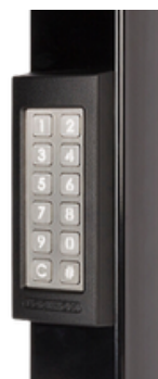
SLIMSTONE-2 - weather resistant keypad with integrated LED backlight