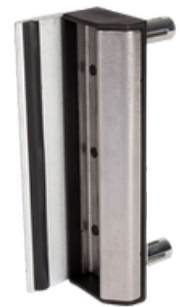
SAKLQ - adjustable keep in a wide range of colours