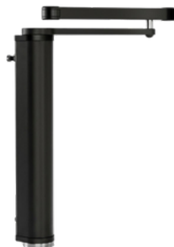
VENUS - motorised gate closer for pedestrian swing gates

Seamlessly integrate security and convenience with automation and access control