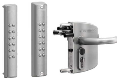
VOLTA - surface mount lock with external battery keypad